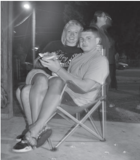
A local couple enjoys the July 16 "Movie in the Park."

See inside for a photo album of the 2010 summer camps season!