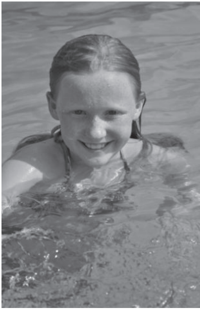
A satisfied Swim Camp participant.

More kids than ever before participated in ABLE Families 2010 season of summer camps. This year's line-up of camps included: Ecology Camp, Chef Camp, Books Camp, CSI Camp, Music Camp, and Swim Camp I and II.